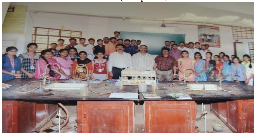
Group Photo of the students with teachers of the course